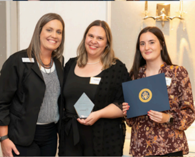
Helping Hands Award Lincoln Park Library