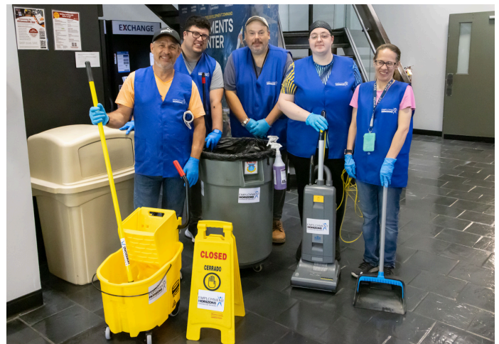
Employees on Employment Horizons' Ability One contract are proud of their work at Picatinny Arsenal.