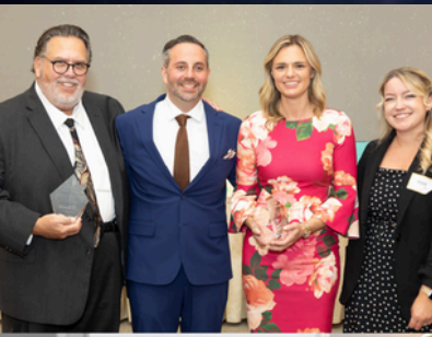
Corporate Champion Award Villa Restaurant Group - Morristown