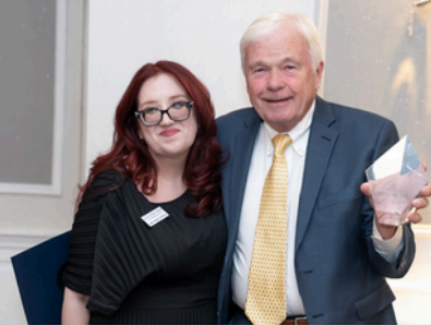
Community Service Award Real Life Choices Transit - Bernardsville