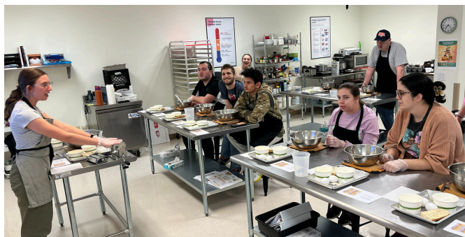
Program participants prepare pasta dough.

The Life Skills Development Group continues to provide meaningful experiences that empower participants to build confidence and independence. Pasta Night was a perfect blend of learning, laughter, and a whole lot of tasty fun!